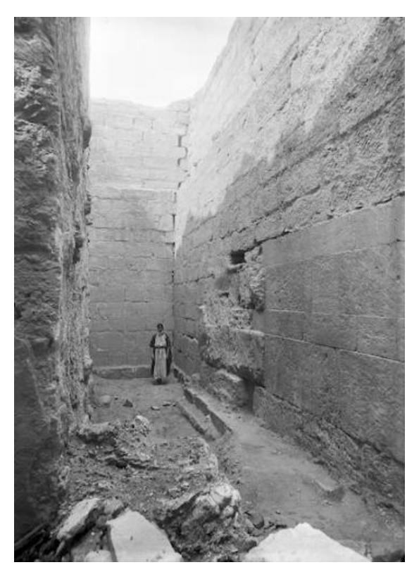
Figure 3: Man standing inside Tower 1, ancient fortifications. corresponds with Baird <u>2011</u>, fig. 2.