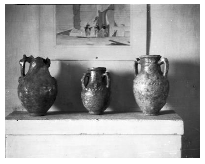
Figure 11: Three faience jars from a private house. Courtesy Yale University Art Gallery, Dura-Europos Collection Fiii63. Corresponds with Baird <u>2011</u>, fig. 19.

Baird points to the way archaeological labour and photography was gendered at Dura and at the contemporary excavation of Verulamium led by Mortimer Wheeler, juxtaposing two photographs showing women archaeologists. In both, the women are cleaning mosaic floors with brushes. As we listen to both these pictures we hear a kind of sad nostalgia, a serene, sweet and pensive melancholy. When we look at the images while listening, the highs and lows of this piece made us think of the action captured – the sweeping back and forth of the person's cloth as they clean the mosaic. The imageas-sound is very contemplative, and easy to imagine the person sweeping to the tempo in a way that re-establishes action and movement in an otherwise static image. Listening to Baird's figure 17 of Verulamium, we wonder if and how the difference in colour of the clothing between these women and the darker robes or attire of the men (workers and archaeologists) may change the song. The song draws our attention away from the mosaic on display and makes us wonder about how the women experienced the excavation. It ends very abruptly - the abruptness, the violence of the ending... Did they experience gendered violence? What was their relationship to the men on site like?