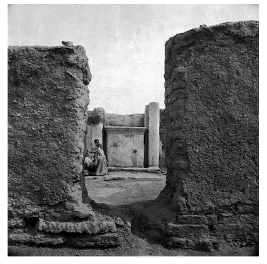
Figure 4: Worker inside the Temple of Azzanathkona. Courtesy Yale University Art Gallery, Dura-Europos Collection, Fx-8; corresponds with Baird <u>2011</u>, fig. 3.

Figure 3: Man standing inside Tower 1, ancient fortifications. Courtesy Yale University Art Gallery, Dura-Europos Collection, c-172; corresponds with Baird <u>2011</u>, fig. 2.