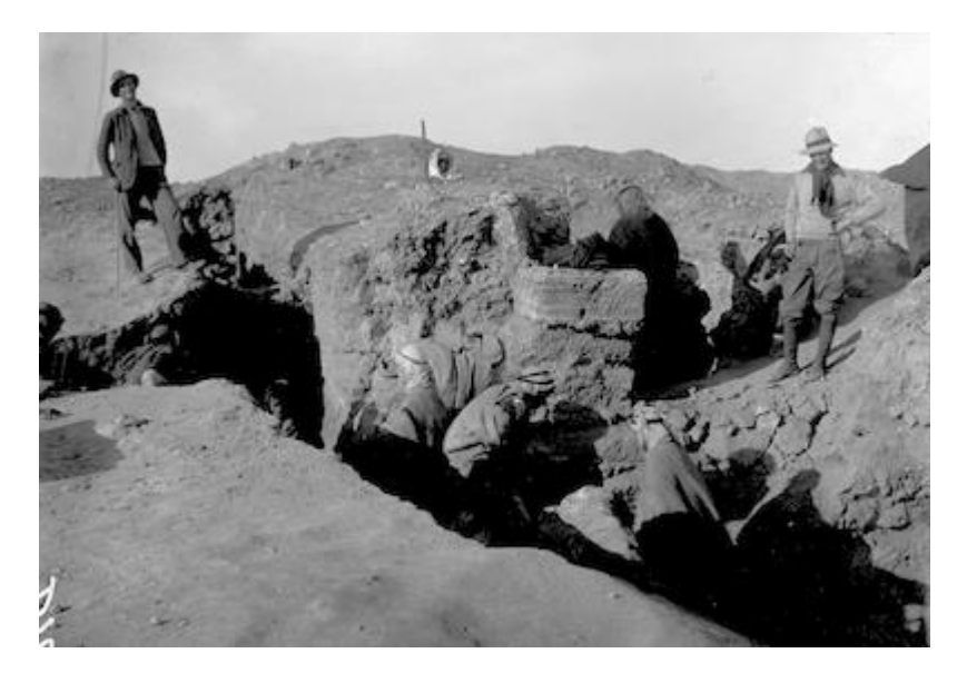
Figure 8: Yale-French Academy team members above trench on main street. Courtesy Yale University Art Gallery, Dura-Europos Collection, d108. Corresponds with Baird <u>2011</u>, fig. 10.