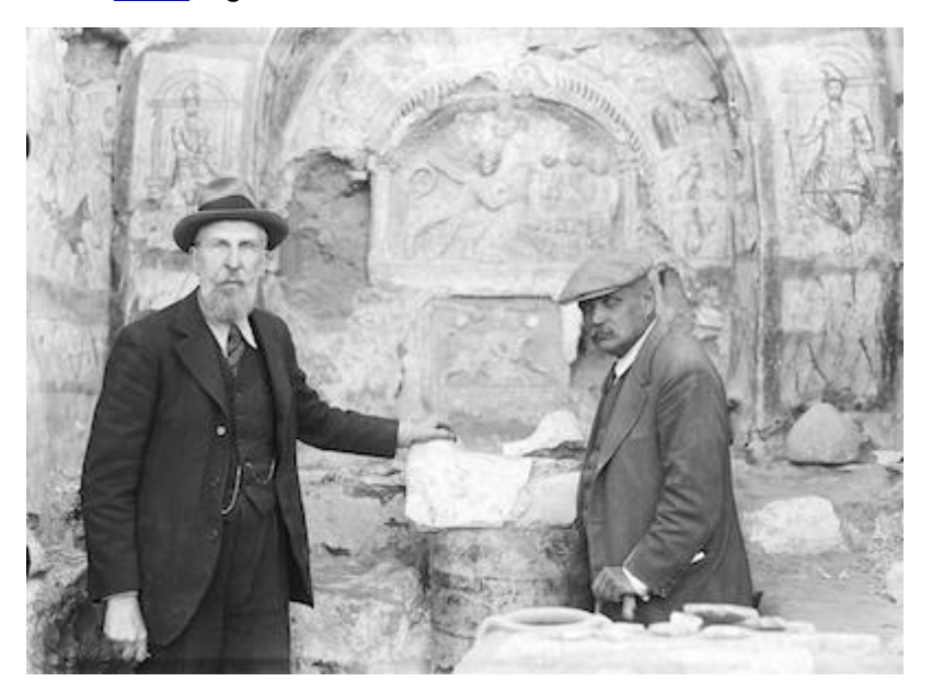
Figure 9: Cumont and Rostovtzeff in the Mithraeum. Corresponds with Baird <u>2011</u>, fig. 11.

Figure 8: Yale-French Academy team members above trench on main street. Corresponds with Baird <u>2011</u>, fig. 10.