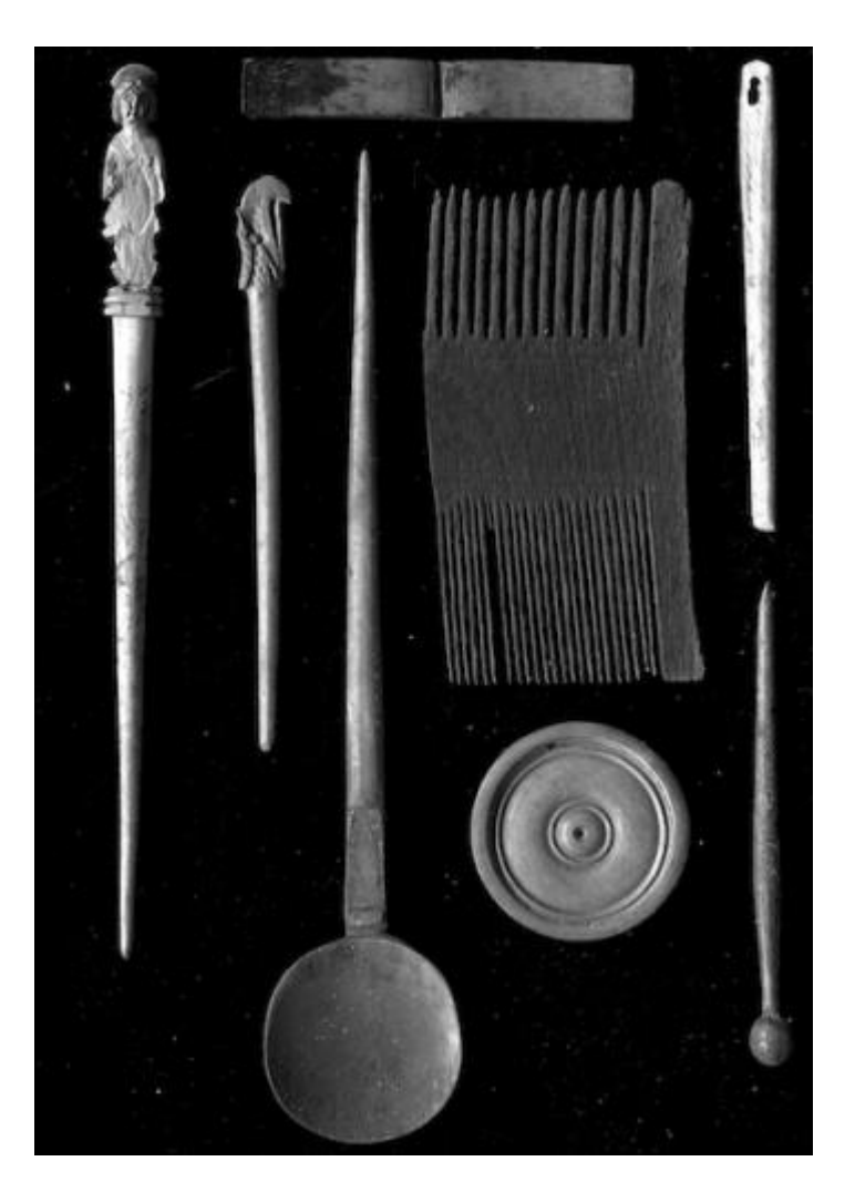
Figure 12: Bone objects from Dura-Europos. Courtesy Yale University Art Gallery, Dura-Europos Collection Dam-147. Corresponds with Baird <u>2011</u>, fig. 22.