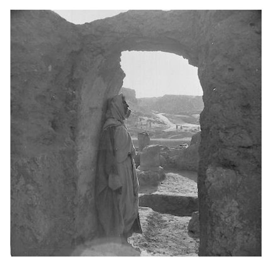
Figure 5: Man standing in doorway of block B2. Courtesy Yale University Art Gallery, Dura-Europos Collection, z-90; corresponds with Baird <u>2011</u>, fig. 5.

Alternatively, we can hear in this a reflection of a submarine's sonar ping or anti-aircraft radar; militaristic modes of searching that push us to reflect on field archaeology's early connection with military men and military organisation. Sonar and radar reflecting off the large ruins, the architectural elements that survive; presaging modern archaeology's remote sensing abilities that pick up the finest details. Like the photomosaic from georadar, the immense labour it takes to create the work is hidden entirely, pushed to the background, forgotten.