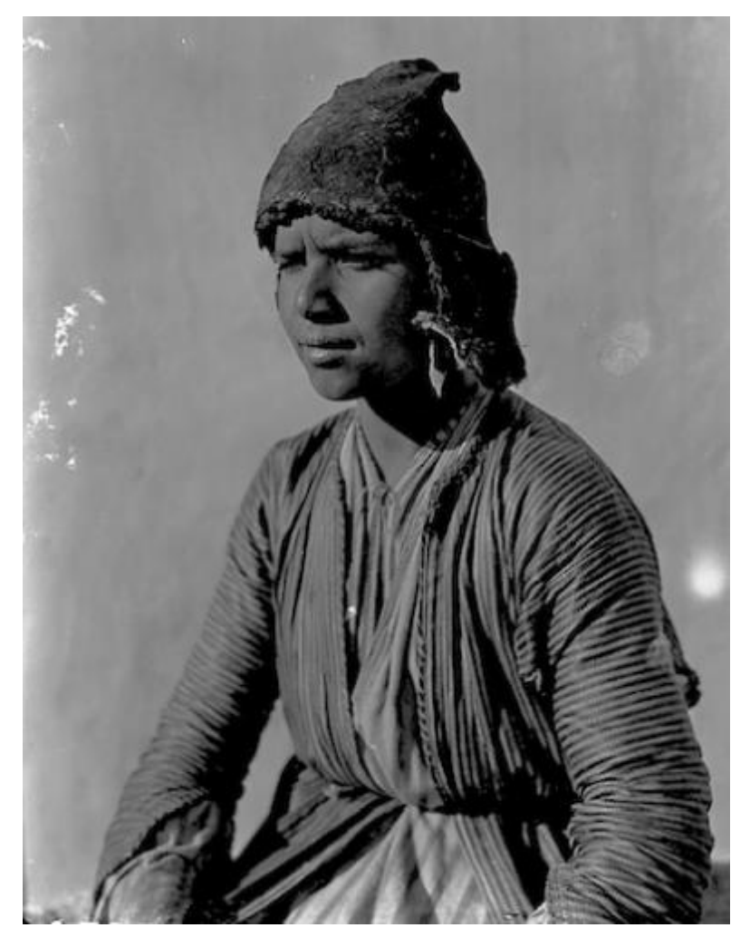
Figure 10: Young man wearing an ancient textile cap. Courtesy Yale University Art Gallery, Dura-Europos Collection g-785. Corresponds with Baird <u>2011</u>, fig. 4.

in Figure 9 (Baird's fig. 11) Cumont and Rostovtzeff, the directors of the expedition, are in the foreground looking directly at the camera, on either side of an architectural fragment. We can think of these images as a sequence zooming in towards the leadership of the Yale team; as we zoom in, and as the faces and poses grow clearer and more central, the sound changes from discord to joyful; dare we say, triumphal?