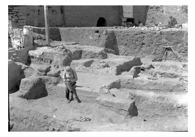
Figure 7: Yale expedition members taking notes on excavated area of the Mithraeum. Corresponds with Baird <u>2011</u>, fig. 9.

Figure 6 (Baird's fig. 15), which depicts teams of workmen toiling to push minecarts filled with rubble out of the site, struck us, when sonified, as serene, hopeful and relaxed: the very antithesis to what is depicted. And yet, while we cannot see the photographer, presumably a member of the Yale team, we know that it isn't him who is toiling to shift the rubble. While the piece is fairly active in its opening moments, it settles down into an almost trudging, repetitive pace, perhaps reflecting the composition of the photo into groups of workers, matching their no doubt slow labour to push the carts along the track. The interplay between the image and the sound drives home the long-standing archaeological habit to erase the labour of precariously employed, racialised individuals from the narrative told.