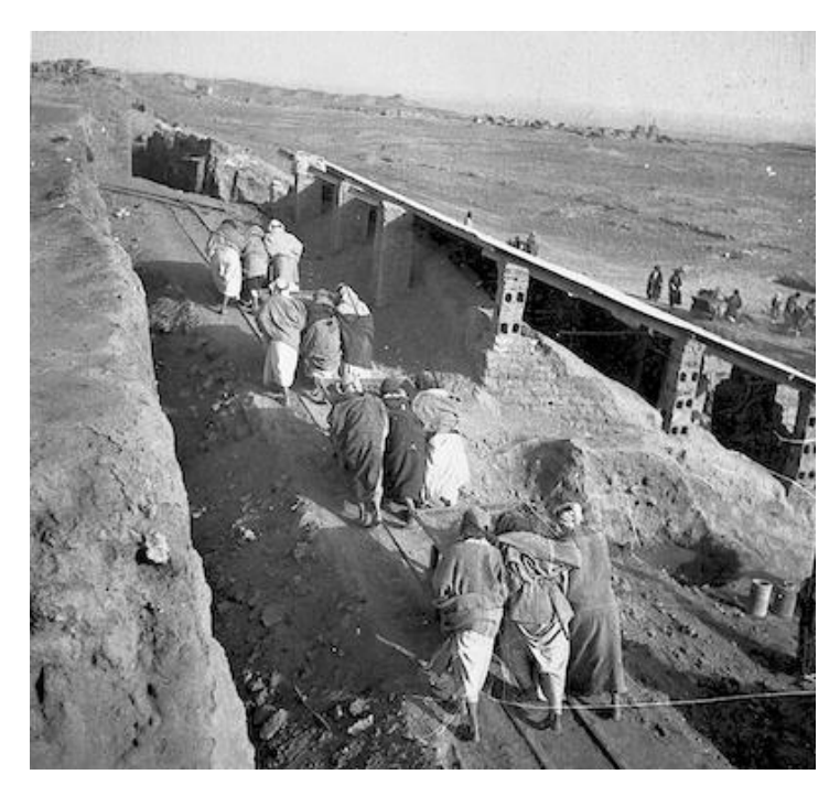
Figure 6: Workers pushing removed dirt in rail carts. Corresponds with Baird <u>2011</u>, fig. 15.

Figure 6 (Baird's fig. 15), which depicts teams of workmen toiling to push minecarts filled with rubble out of the site, struck us, when sonified, as serene, hopeful and relaxed: the very antithesis to what is depicted. And yet, while we cannot see the photographer, presumably a member of the Yale team, we know that it isn't him who is toiling to shift the rubble. While the piece is fairly active in its opening moments, it settles down into an almost trudging, repetitive pace, perhaps reflecting the composition of the photo into groups of workers, matching their no doubt slow labour to push the carts along the track. The interplay between the image and the sound drives home the long-standing archaeological habit to erase the labour of precariously employed, racialised individuals from the narrative told.