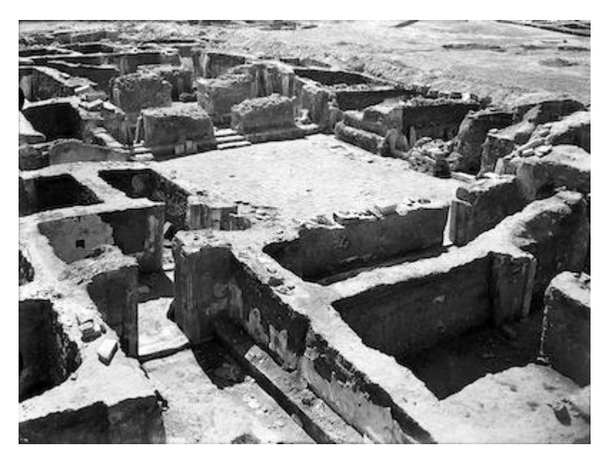
Figure 2: House of Lysias, Block D1. Courtesy Yale University Art Gallery, Dura-Europos Collection, k-327; corresponds with Baird <u>2011</u>, fig. 1.

overburden is removed, everything is cleaned down to the floors and mudbrick walls. There are no people populating the image. It is a mosaic of light and dark with a central room in brilliant sunshine, surrounded by shadows. As we listen to Figure 2 (Baird's fig. 1), we hear something that sounds like 'a song about separation and the journey to find something'. The interplay of notes creates harmonies that give a sense of sad nostalgia and longing. Contrary to the intent of the excavators, the image-as-song doesn't create a sense of timelessness or arrested decay, but rather, one of loss, archaeology as a brief flicker in the biography of the city, a final moment in the light. We are reminded forcefully of the destruction of archaeology, of the erasure it perpetuates onto the people of the past, and of the emptiness that is often left behind once the artefacts are removed.