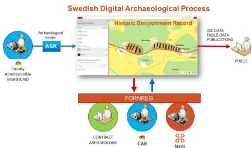
Figure 2: The Digital Archaeological Process implemented in Sweden in 2018. The County Administrative Board system (ASK) sends administrative data about planned archaeological excavations and surveys to the Historic Environment Record (HER). Via the web tool Fornreg the archaeologists can update HER with new information and upload the finished reports. Administrators at CAB can make the new data public and NHB can add information about which museum receives the artefacts. All content is open for public use through web search Fornsök and the Open Data Portal. Illustration: Åsa Larsson, CC-BY

Despite the loss of the archaeological unit, the NHB still has a very central role to play with regard to contract archaeology, apart from overseeing regulations. The NHB is assigned the task of keeping a national Historic Environment Record (HER) with information about ancient and historic sites to help CAB in their decision making. This includes information about sites that have already been excavated and removed, as they are vital to understanding the landscape. For instance, CAB often orders surveys to be done by contract archaeologists in areas scheduled for development, in order to identify previously unknown sites, including studying archival information. For this reason, the NHB Archive receives a copy of every report produced by contract archaeology (see below).